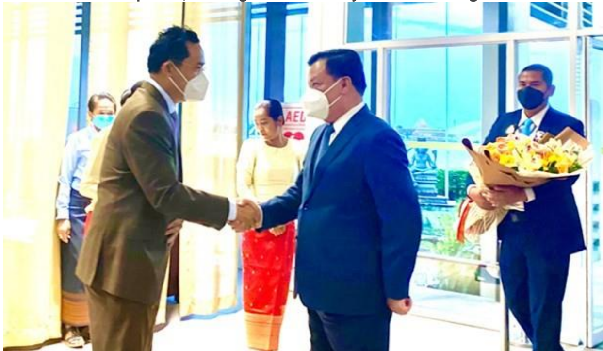
Politburo member and Secretary of the Hanoi Party Committee Dinh Tien Dung (R) is welcomed at the airport in Phnom Penh.

A high-level delegation of Ha Noi led by Politburo member and Secretary of the municipal Party Committee Dinh Tien Dung arrived in the Cambodian capital of Phnom Penh on April 26, starting their three-day official working visit.