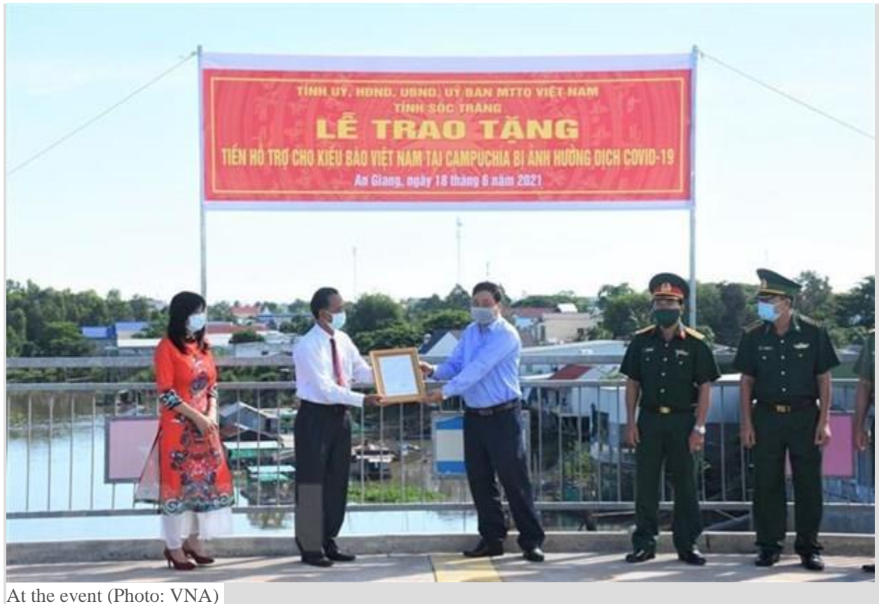
At the event

Soc Trang (VNA) – The Vietnam Fatherland Front (VFF) in Soc Trang province on June 18 granted 200 million VND (8,690 USD) to the Khmer-Vietnamese Association to support Khmer people of Vietnamese origin in Cambodia affected by the COVID-19 pandemic.