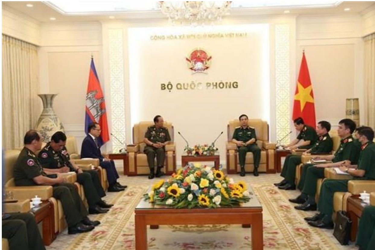
Minister of National Defense Gen. Phan Van Giang held a reception for visiting Cambodian Deputy Prime Minister and Minister of National Defense Tea Banh in Ha Noi on May 23.

Expressing his delight at the success of the first ministerial-level Vietnam-Cambodia border defense exchange, Minister Giang highlighted its significant meaning in strengthening the two countries' solidarity and friendship.