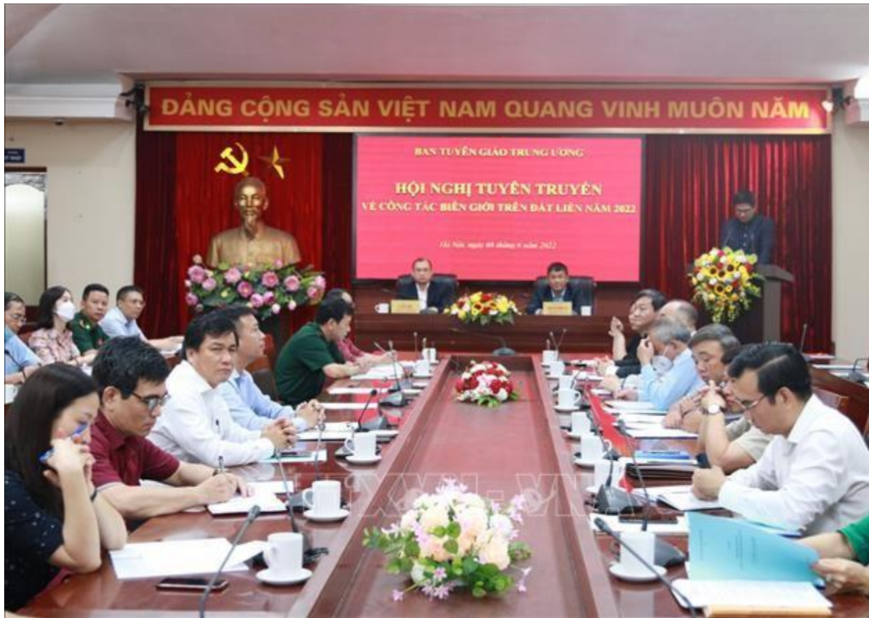
The conference on communication work on land border affairs in 2022 was held in both in-person and online forms on June 8.

Communication activities play an important role in the management and protection of the national land border, said Le Hai Binh, deputy head of the Party Central Committee's Commission for Education and Popularisation.